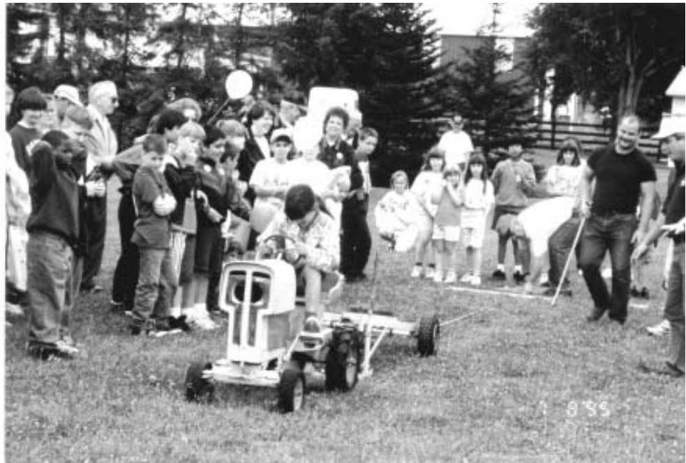
These pedal tractors were specially built to withstand the stress put on them by "drivers" of different ages and sizes.